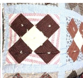
SQUARE IN SQUARE QUILT