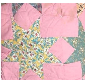
OHIO STAR QUILT