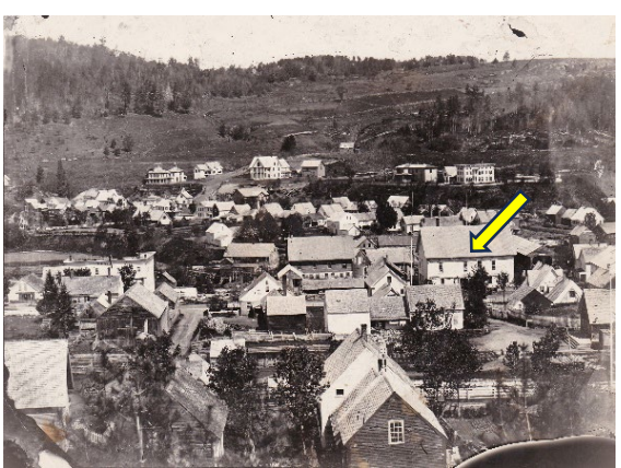
Wells & Woolson's store